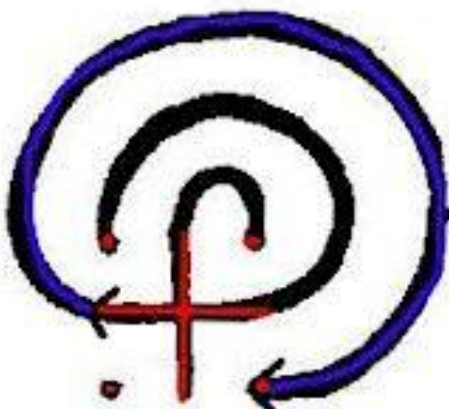
4. STEP FOUR Continue As In Picture