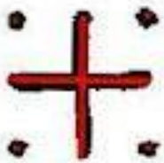
1. STEP ONE Draw A Cross With Four Dots