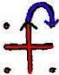
2. STEP TWO Connect Top With First Right Dot