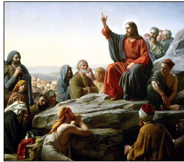
An artist's image of Jesus Christ giving the 'sermon on the mount.'

The holy book in Christianity is called the Bible . A church is a building designed for Christian worship.